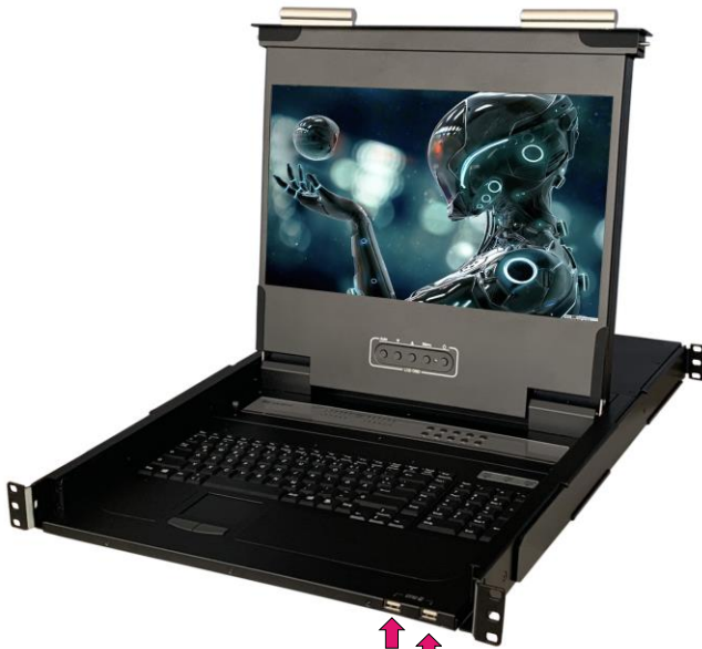
USB port for Keyboard/Mouse

Optimize rack space. Maximize rack monitoring