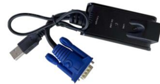
CAT6 KVM Dongle-USB&VGA (DGU)