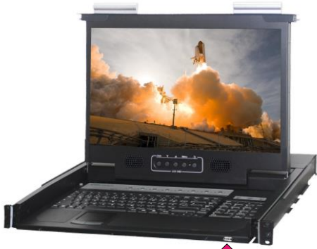
(USB Port for device access)

Optimize rack space. Maximize rack monitoring