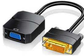
DVI 24+1 changer