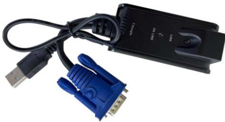
CAT6 KVM Dongle-USB&VGA (DGU)

Optimize rack space. Maximize rack monitoring