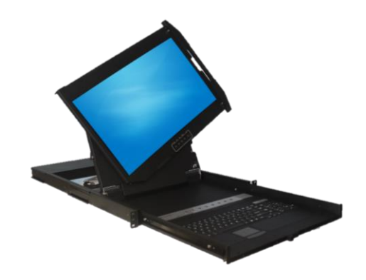
Display rotate to the right