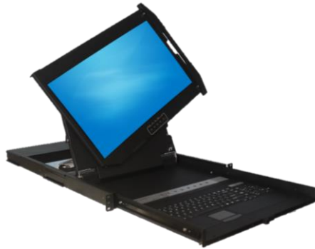
Display rotate to the right