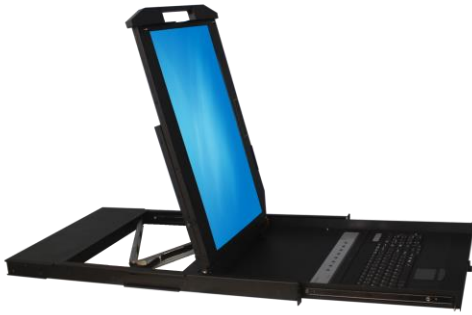
Lift the display

Optimize rack space. Maximize rack monitoring