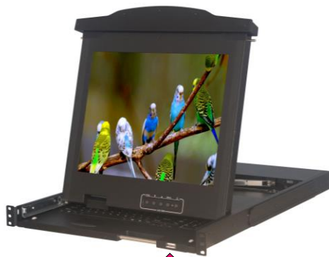
(USB Port for device access)

Optimize rack space. Maximize rack monitoring