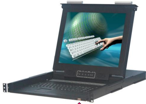
(USB Port for device access)

Optimize rack space. Maximize rack monitoring