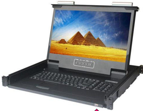
↑ (USB Port for device access)

Optimize rack space. Maximize rack monitoring