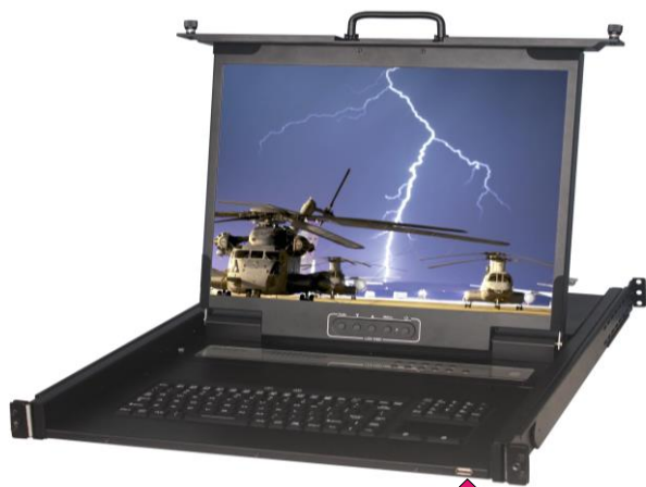
USB port for Keyboard/Mouse

Optimize rack space. Maximize rack monitoring