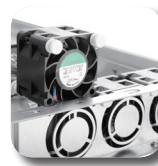
Up to 3 x 40mm rear fans