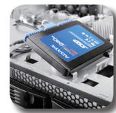
3 x internal 2.5" HDD bays